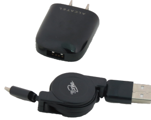
▼ Accessories Accessory kits: charger, charging cable