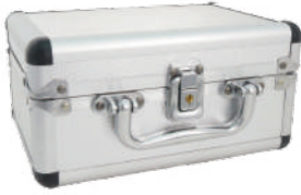
▼ Accessories Shake-proof box size: 200mm*140mm*100mm